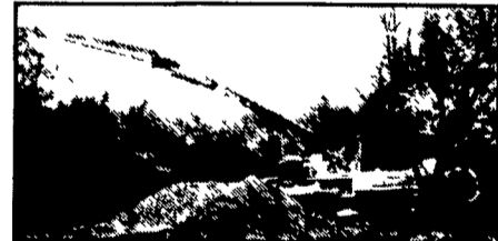
92' Boom Placing Concrete