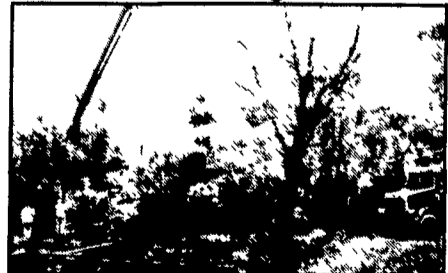
Placing Concrete On Site

Take the questions out of your new construction. Call Balmer Bros. for quality engineered walls.