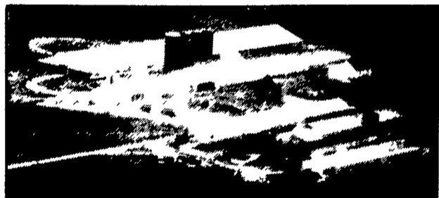
Far Left: 1-Million Gallon Circular Manure Storage Tank Far Right: 2 Silage Pits In-Barn Manure Receiving Pit

17 Years Experience In Pouring Concrete Manure Pits!