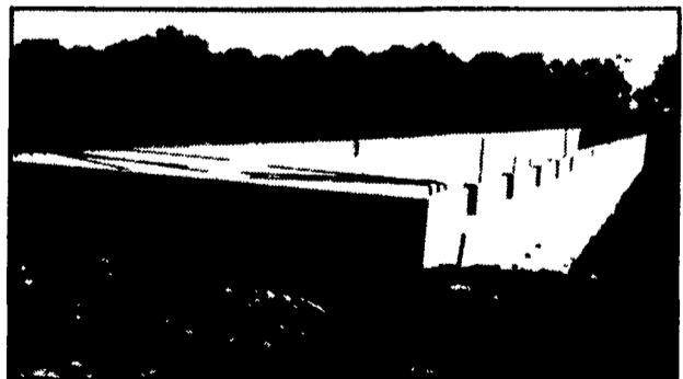
300' Long Manure Pit For Hog Confinement