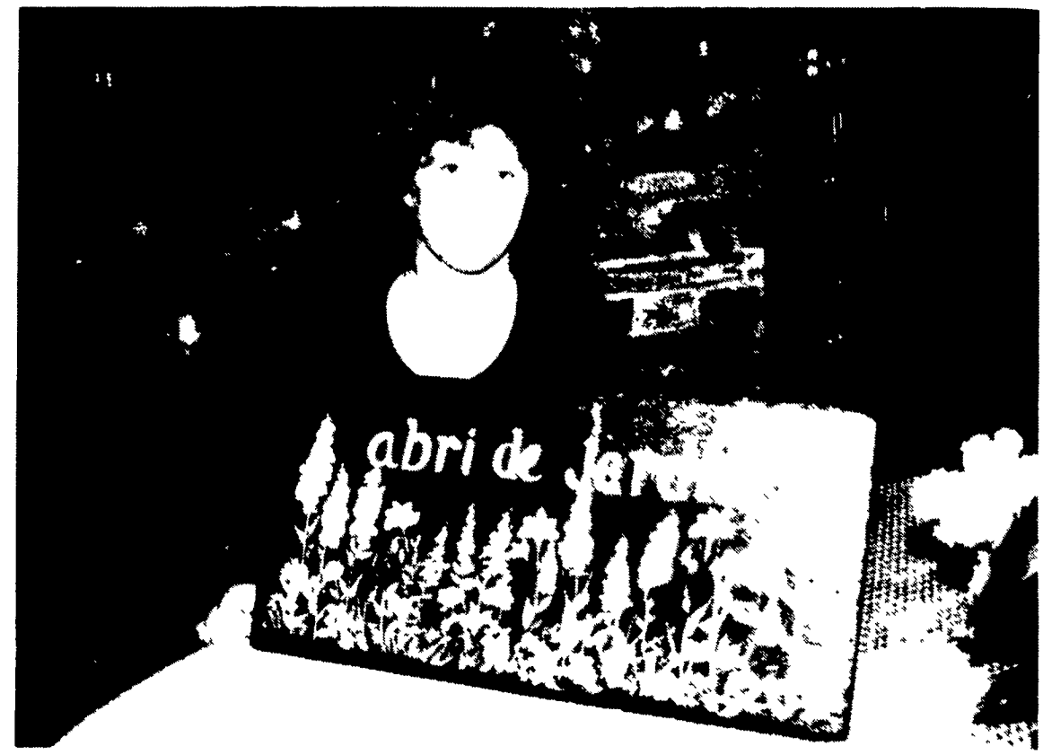
A touch of French adds class to the slate-painted garden scene.

Now, Clarinda's combined a little bit of all these activities to launch her latest venture — a Basket Garden Party.