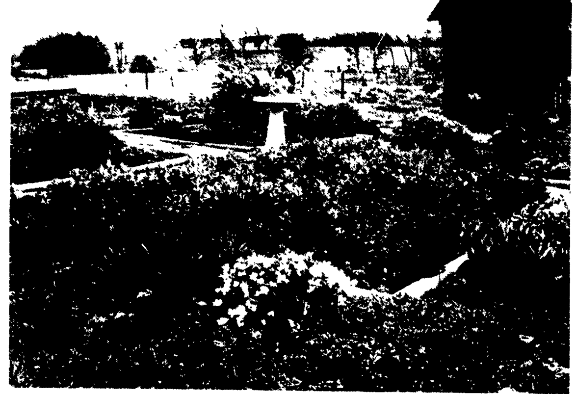
More than 140 varieties of perennials surround the Leatherman farm in Hamburg. Notice the cows that graze in the background.

Directions to the Leatherman farm: Route 61 and 662 at Shoemakersville light go south on Route 662 to first left Drieblebis Mill Road (bear right) and follow signs. For more information, call (215) 562-4161.