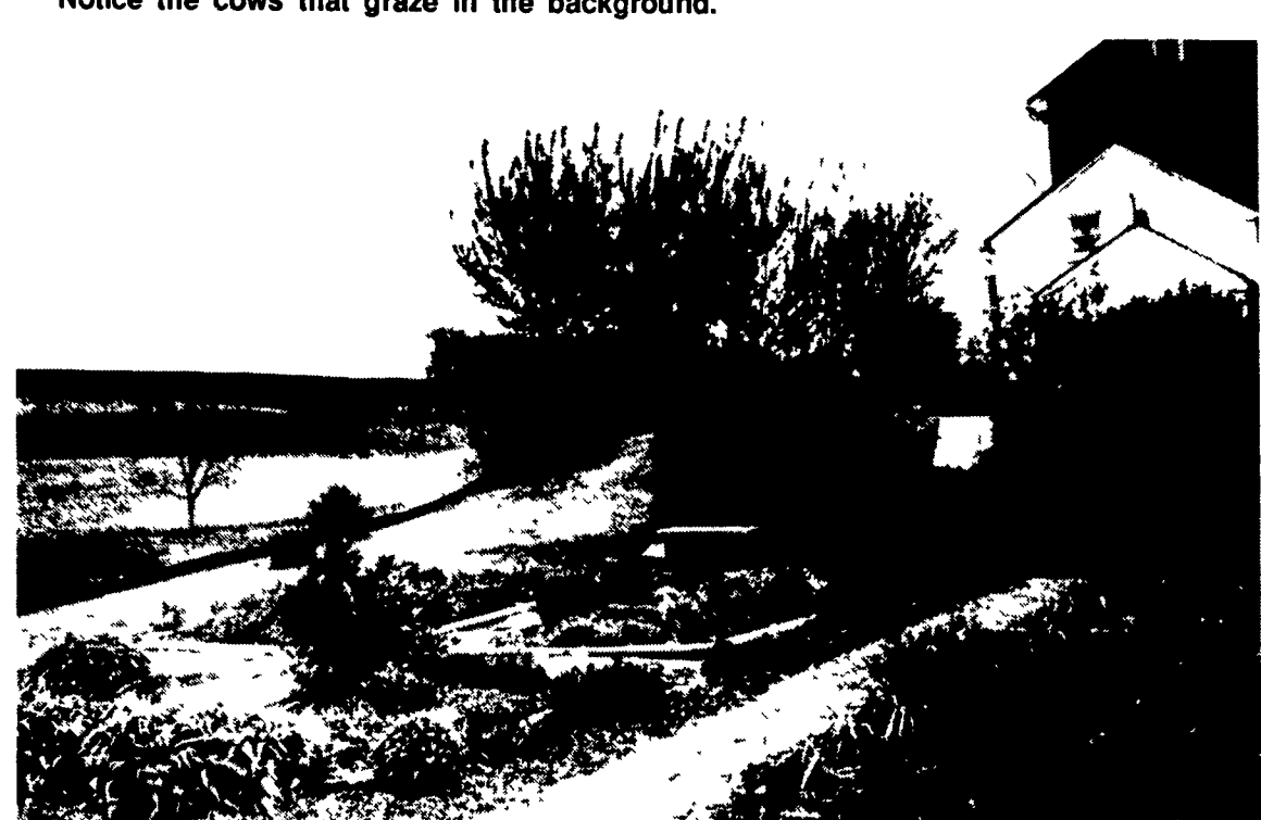
Clarinda offers assistance to those who would like to set up herb and perennial gardens. It's important she said to know the growth patterns of plants so that the garden looks good year-around.