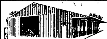
Customized (Many Options Available)