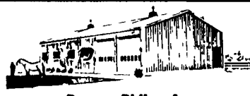
Barns - Riding Arenas With or Without Stalls

"Order Through: Perka's Top 1990 Marketing Agency"