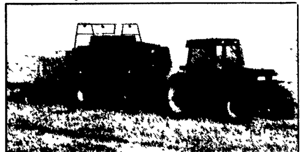
8580 Large Baler In Stock For Immediate Delivery

Center-Line Design The Same As The Small Balers Makes This Productive Machine Easy To Operate, Too.