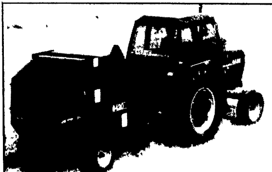
8420 Round Baler In Stock For Immediate Delivery