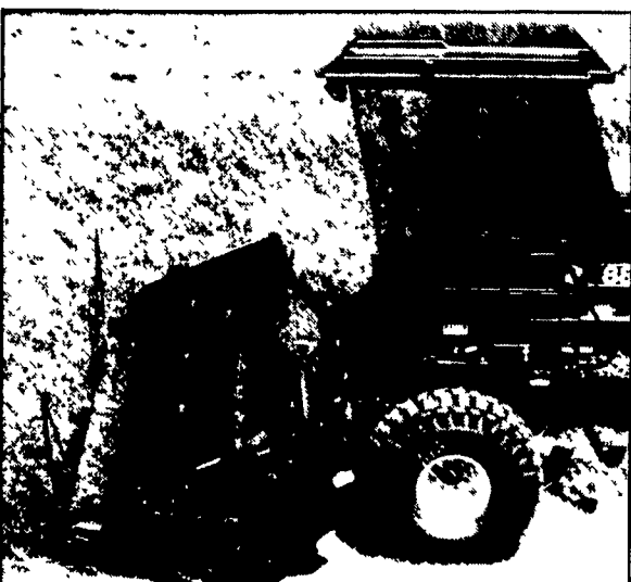
8830 With 12' Header In Stock For Immediate Delivery