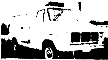
1985 GMC Thermo King Reefer Cargo Van, w/Side Door, 350 V8, AT, PS, PB, 77,000 Miles Med Temp. Brand New Engine, 3 Yr 50,000 Mile New Engine Warrantee Available For Sale Or Lease

Just Off I-78, Between Allentown & Quakertown