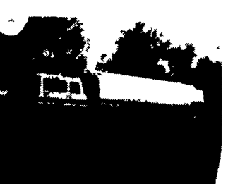
Retail Fuel Trucks, Gas Or Diesel, Aluminum Tanks & Steel Tanks, Also Alum. Trailers From 2000 Gal. to 8300 Gal. (15) To Choose From.