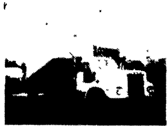
34 Ft. Dump Trailer, Good For Hauling, Saw Dust, Wood Chip, Silage, Tandem Axle, Will Sell w/ Or w/out Tractor.