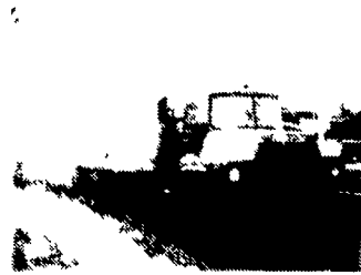
3-MD Model Mack's Double Frame, 6 Spd. Low Hole, PS, Long Wheel Base, Just Reconditioned, W/ or W/Out Bodies.