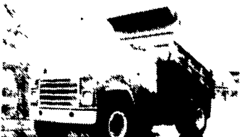
1979 Red. Int. S1924 Dump 415 V8, 5/2 Sp., AB, 26,500 GVW, Only 63,000 Miles, Several Different Size Dumps To Choose From, All Extra Clean & Ready To Work