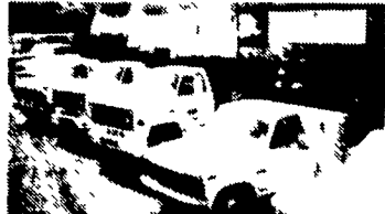
Stake Body Dumps In Good Working Condition Priced Under $5,000 - While They Last