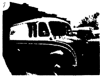
Divco's Of All Sizes, Ref. or Non Ref. (20) Of All Sizes To Choose From.