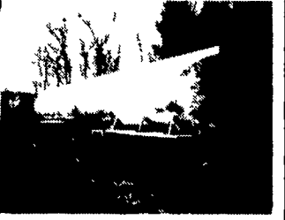
Tank Trailers - Stainless Steel & Alum. 5500 Gal. to 8300 Gal., 5 To Choose From.

***** MORE THAN 250 TRUCKS ON LOT AT ALL TIMES USED TRUCKS OF ALL TYPES - GRAIN BODIES - REEFER - DIRT DUMPS TRUCK TRACTORS - SINGLE AXLE - DRY & REF BODIES. NEW & USED STAKE AND DIRT DUMP BODIES OF ALL SIZES - (We Buy, Sell & Trade) USED TIRES, WHEELS, OF ALL SIZES - USED TRUCK PARTS AND MOTORS - GAS AND DIESEL *****