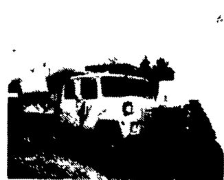
1981 Int. Diesel, PS, 5+2 Spd., 4 Door Crew Cab Dump (8) More Crew Cabs, Gas Or Diesel.