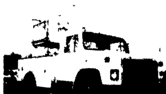
80 Int. Hi Rise Platform Truck w/Utility Boxes, V8, AT, or Stick, Just Came Off Of NJ Fleet Maintenance Priced To Sell