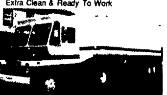
Rare 1984 Chevy Grumman Alum. Trk. & 25' Det Gooseneck Trailer, 350 V8, AT, Ps, 35,000 Org Miles, Full Swing Doors & Side Door & Lots More, Call For Details, Avail For Sale Or Lease

TWO ACRES OF ALL TYPES USED TRUCKS. "IF WE DON'T HAVE IT, WE'LL GET IT"