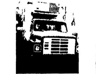
Ref. Trucks Of All Sizes, Plate Ref. or Thermo King From 9 Ft. to 22 Ft. Will Sell Bodies Or Complete Tk. (25) To Choose From.