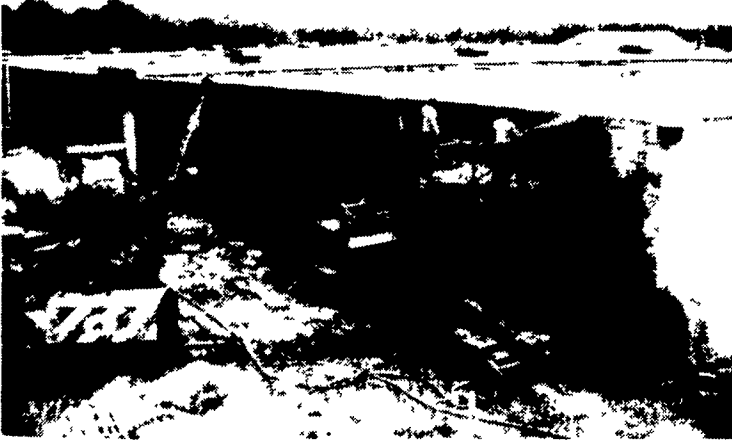
Block Wall Being Restored With Gunite