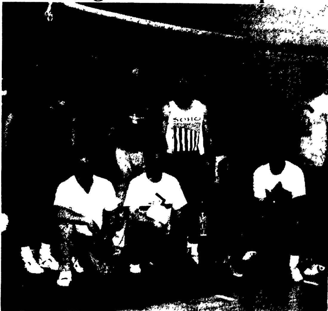
MERTZTOWN, Berks Co. — Recently, the eastern region of Pennsylvania Young Farmer chapters held their annual volleyball competition at Kutztown Area Senior High School.