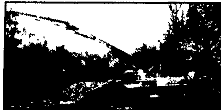
92' Boom Placing Concrete