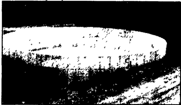
In-Ground Liquid Manure Tank For Hog Operation - 324,000 Gal.