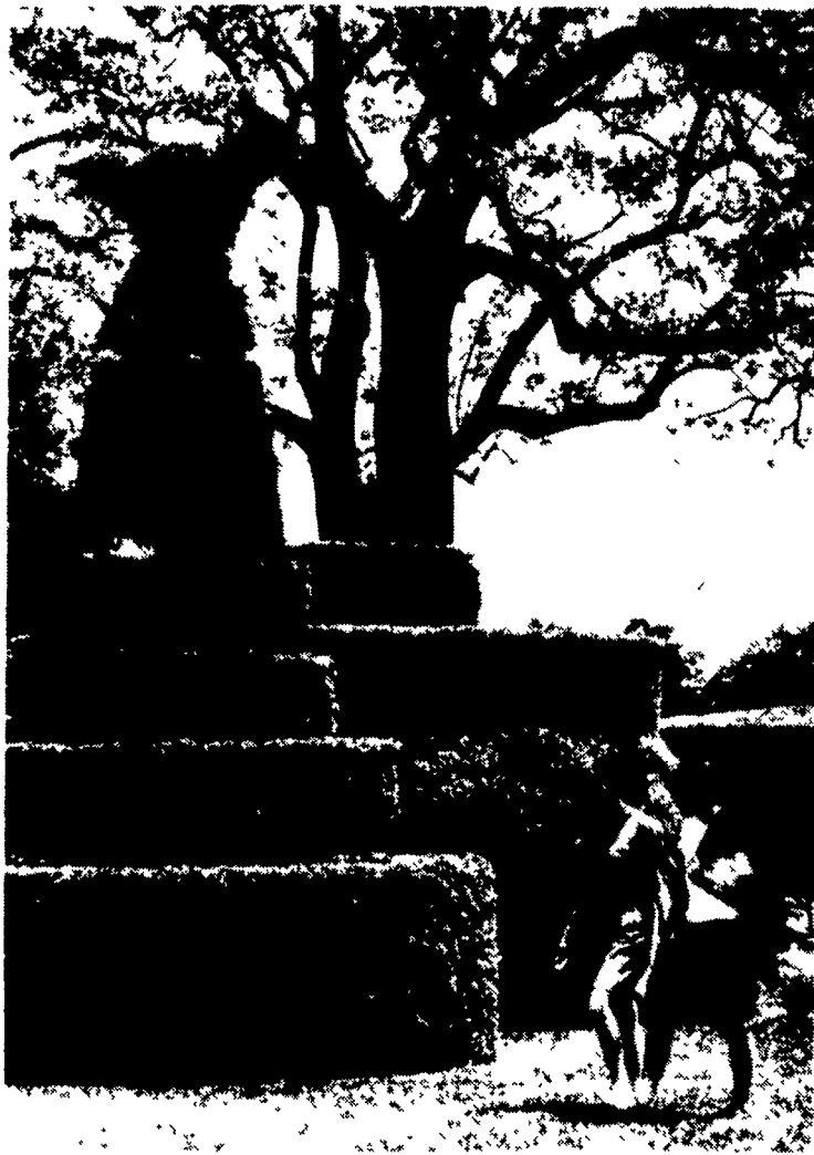
A leisurely stroll through Acres of Spring at Longwood Gardens, Kennett Square, offers fanciful topiary, spectacular flowering trees such as these lilac-blossomed paulownias shown here, thousands of flowers, and sparkling fountains.

For a complete schedule of events, send a self-addressed