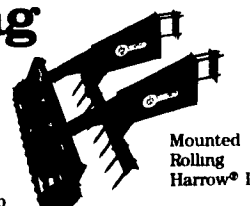
Mounted Rolling Harrow® 1

Warehouses in Ohio, Iowa, Kansas, Georgia, and Saskatchewan, Canada