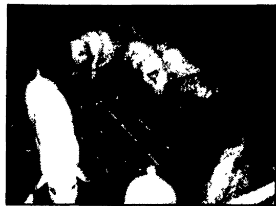
Hog "Waffle Slats" Concrete Hog Penning

The concrete slat with Your Animals Comfort In Mind