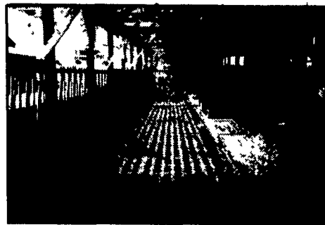
Heifer "Waffle Slats"

The concrete slat with Your Animals Comfort In Mind