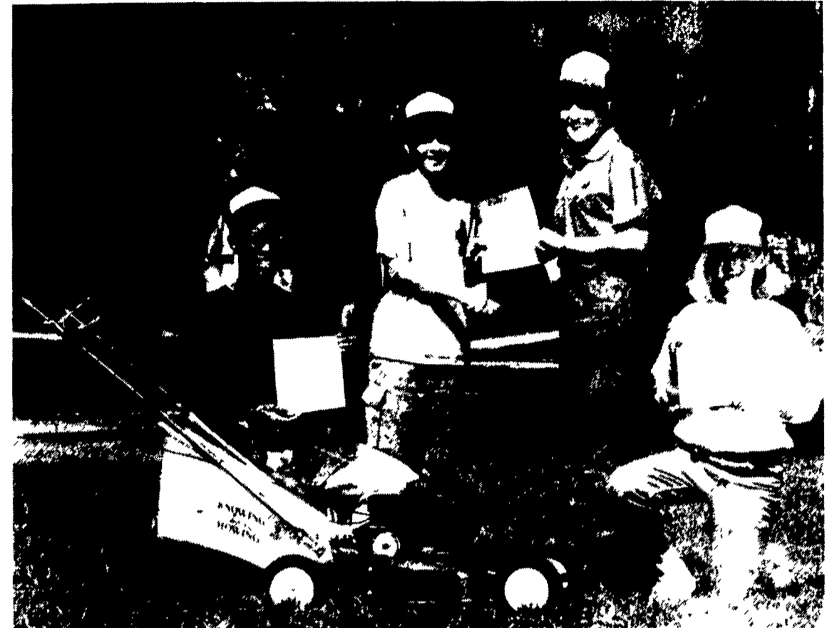
A "Knowing Mowing" instructor presents students with certificates after completing the "Knowing Mowing" lawn mower safety course sponsored by Briggs & Stratton and the American Red Cross. Some of the important safety tips they've learned are: never mow barefoot, never pull a mower toward you and always mow when grass is dry.

3. No. The blade can take 3 to 10 seconds to stop spinning after the