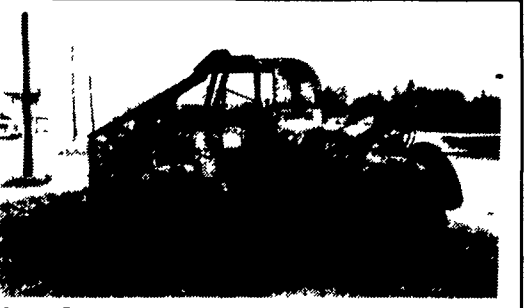
1977 Clark Ranger 664B Log Skidder, 3 Cylinder GM Diesel, Good Winch, Runs Good.