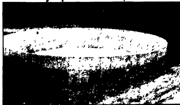
In-Ground Liquid Manure Tank For Hog Operation - 324,000 Gal.