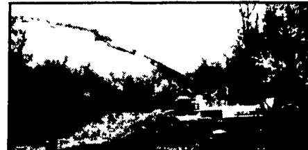
92' Boom Placing Concrete