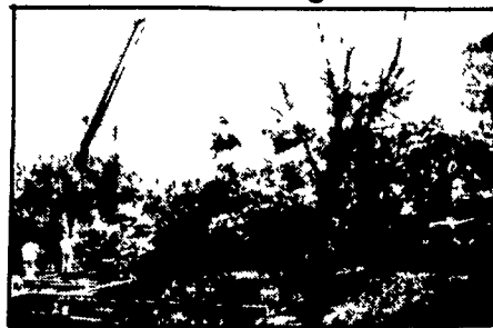
Placing Concrete On Site

Take the questions out of your new construction. Call Balmer Bros. for quality engineered walls.