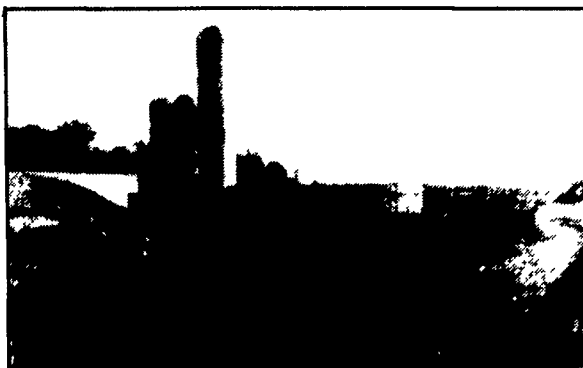
Above-Ground Liquid Manure Tank For Dairy Operation - 235,000 Gal.

17 Years Experience In Pouring Concrete Manure Pits!