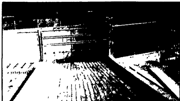
FEATURING TRACTOR GUARD FOR SCRAPING FEED LOT

- WORKING WITH FARMERS WITH CHESAPEAKE BAY FUNDING -