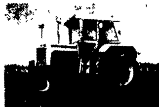
Case 1030, Cab, 18.4x38's Dual Remotes, Rear Wheel And Front Weights, 101 HP.