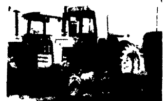
Oliver 1855, 1974 Cab, 3130 Hrs., 18.4x38's, Dual Remotes, Front Wts.