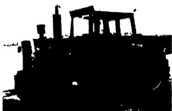
Massey Ferguson 1155, 1975 Cab- Air 2733 Hours, 18.4x38's w/Axle Duals, Dual Remotes, Weights, 140 HP.