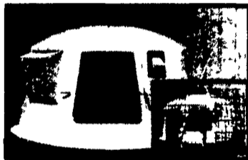
POLY DOME 60"(H) x 88"(D)

The Poly Square Big Foot is constructed of Opaque material to eliminate the solar effect. It blocks out sunheat-not sunlight. Poly Square's inverted ribs and 5' (W)x7'6"(L) make it the biggest unit on the market today and extremely wind resistant.