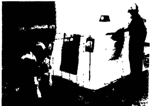
New Side Hay Feeder - Made especially for Poly Square Big Foot, no other unit has this feature. Also has a center roof vent for better air movement.