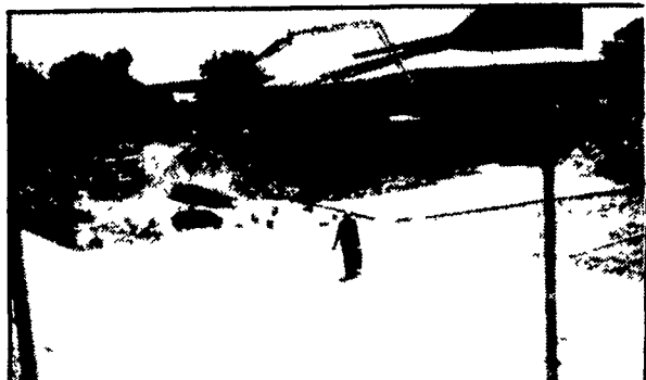
WE SPECIALIZE IN EARTHEN CONCRETE LINERS FOR MANURE STORAGE

- WORKING WITH FARMERS WITH CHESAPEAKE BAY FUNDING -