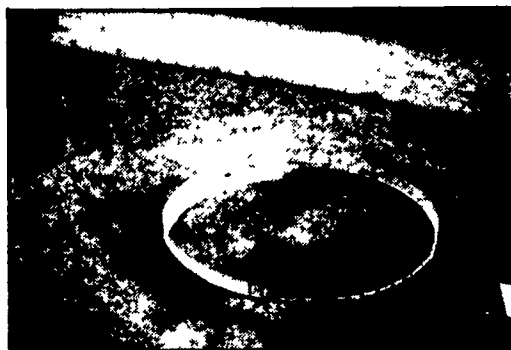
IN GROUND MANURE STORAGE SYSTEM

Our Sales Tool Is A Satisfied Customer - Call Us For Information!