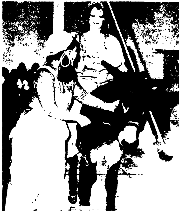
Nneet... that's the thing to look for during the Grassland FFA donkey basketball game on Fri., Feb. 22 at Garden Spot High School.

For further information, contact Garden Spot High School at (717) 354-4031.