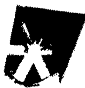
Wall Fan w/Hood & Painted Galv. Cabinets