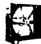
PORTABLE COOLING FAN