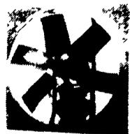
Belt Drive Panel Fan

All Types Of Fans For All Types Of Buildings