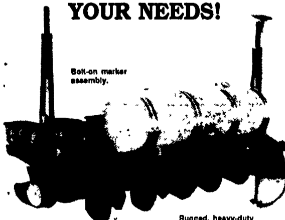
Bolt-on marker assembly.