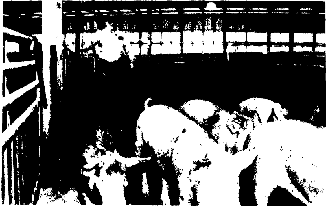
Ezra Good moves pigs from the receiving dock into large pens at the newly constructed hog receiving station near Denver, Pa.