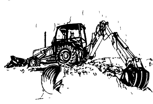
FORD for INDUSTRIAL