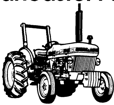
FORD for FARMING