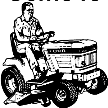
FORD for LAWN & GARDEN