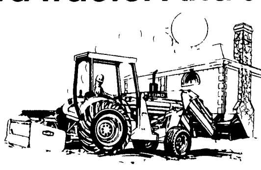
FORD for LANDSCAPING