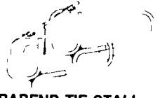
DURABEND TIE STALL