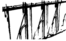
QUICK RELEASE SELFLOCKS