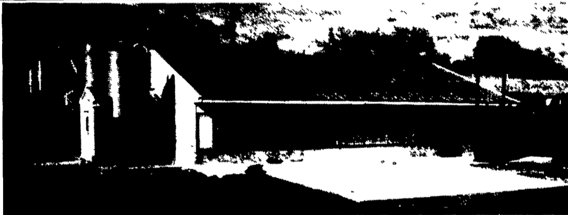
300 Head Finishing Building