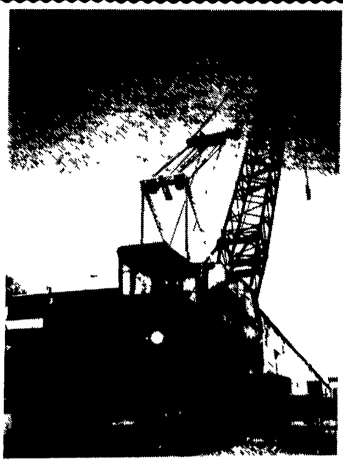
40 Ton Manitowoc 130' Boom + 40' Jib, Cummins Diesels, Excellent Cond. 3,300 Miles On Carrier $30,000 (301) 486-6691

Double 4 Bou-Matic parlor. Expandable to a double 6 or a double 8. Good condition. 717-627-4824.