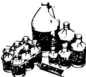
Parts & Accessories