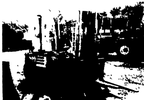
Hyster 6000 Lb. Gas Forklift, Cheaper Running Machine Good For Occasional Use.