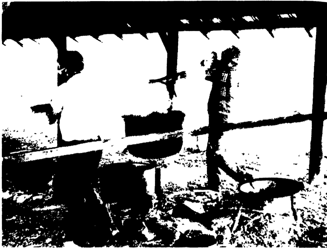
For 38 years, church members have made apple butter the old-fashioned way, enjoying the fellowship and taste that comes from the all day and all night activity.

Even breakfast needs to be eaten in shifts. Someone needs to continually stir the apple butter! As the day wears on, more and more volunteers appear on the scene. People are busy filling jars of apple butter for customers, fixing and serving homemade chicken corn soup, bean soup, homemade ice cream and pie. In addition,