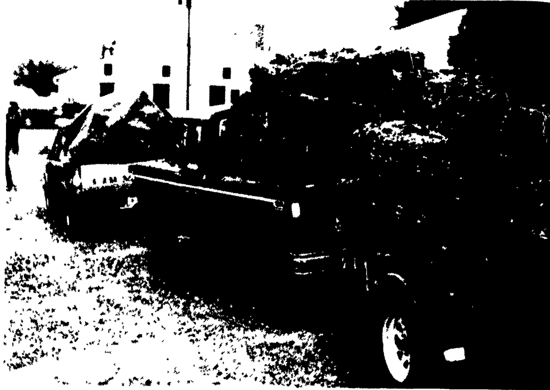
About 400 growers were on hand for the opening of tobacco auction season on Monday. Maryland type 609 tobacco reached a high of $1.62 a pound at the auction.