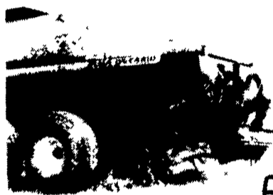
HUSKY FRONT MOUNT SOIL INJECTORS

IF IT'S FOR LIQUID MANURE AND WE DON'T HAVE IT -