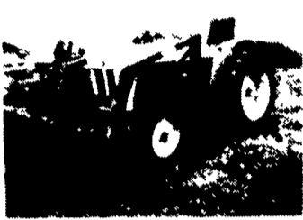
• 21593 Satoh 850G Tractor 27 HP, Gas, 3 Pt. PTO, w/National Loader, PS, Frt Pump $3,975