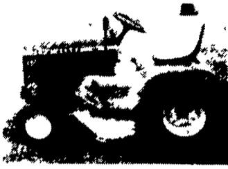
• 21625 John Deere 110 L&G Tractor 8 HP Variable, Over- hauled, 39" Mower, Very Nice $695.00