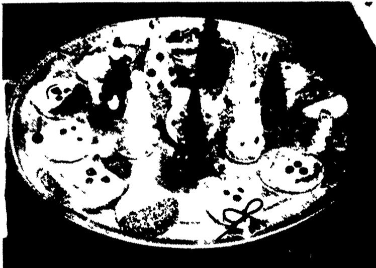
Kids can have fun helping decorate these trees, which are really inverted ice cream cones.

Hetty Wengert presented ideas for making and tying scarves to dress up outfits. To make a scarf rosette, cut a fabric strip (Turn to Page B18)