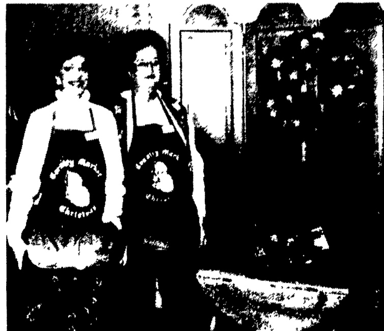
Country Market-Nursery Holiday Center of Palmyra had several Christmas displays arranged around the room for participants to examine.