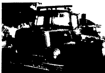
(53371R) 85 FORD LN8000 18' C/C 3208 Cat, 5 & 2, Air Brakes, 35,000 GVW Reduced to $15,500