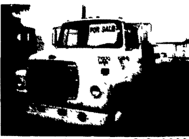
87 FORD L8000 22' C/C 3208 Cat W 5 Spd Air Brakes, P/S, Extra Clean, Low Miles .2 Available Reduced to $17,500 Ea.