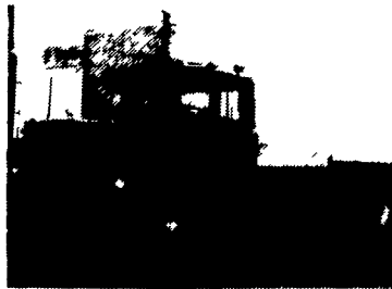
83 MACK U686ST T A 24' C/C, Mack 300 W 5 Spd, 46,000 GVW H D Spec's Reduced to $14,000