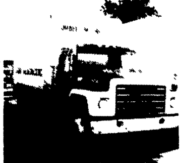
(42954Q) 84 IHC 1654 14' VAN 6.9L Diesel, 5 Spd, Hyd Brakes, 21,500 GVW, 206 W B, 101 CA Nice Truck $6,900