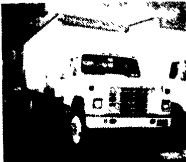
(32606Q) 83 IHC 1954 24' VAN L/G DT466, 5 Spd, Air Brakes, 33,200 GVW, 144,000 Mi Reduced to $10,500