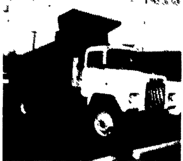
(TC2888) 79 MACK U686ST 10' Dump 300 mack, 5 Spd, Air Brakes, P/S, A/C, 33,500 GVW Reduced to $18,900

Lancaster, PA • (717) 569-2648 • Ray Leed or Dave Yerger