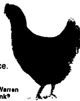
DEKALB Warren Sex-Sal-Link®

Proving herself year after year under varying conditions. High performance.