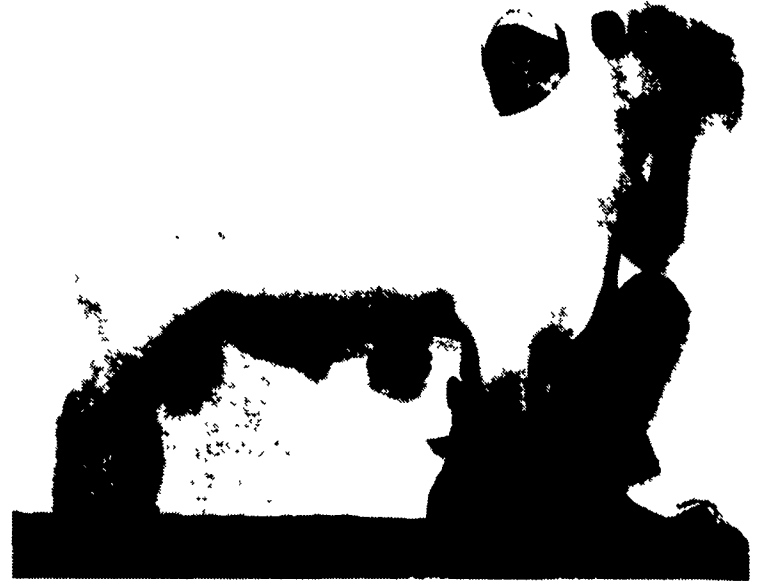
Gerald Thoma shows the champion Oxford ram at KILE.

3. The scholarship must be applied to the student's continued