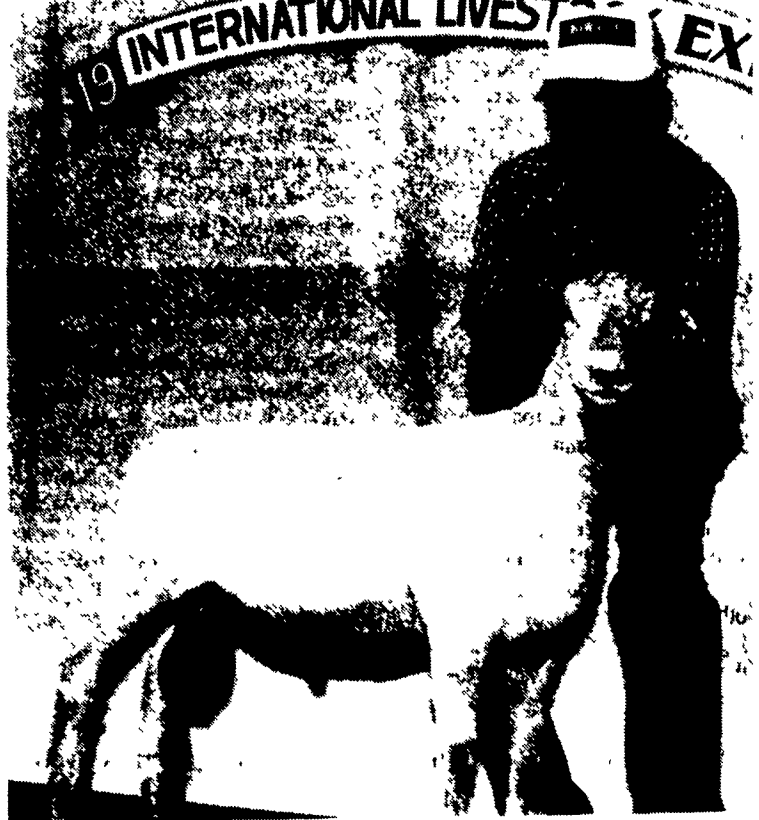
The champion Southdown ram is shown by W.G. Carpenter of Maryland.