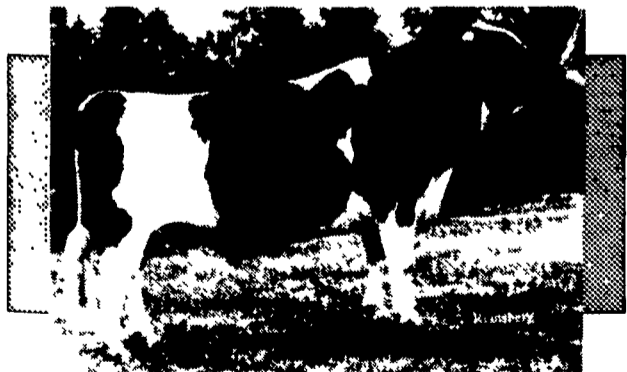
8H2010 Revelation +2,212 lbs.M +$182 +1.49 PTA-Type