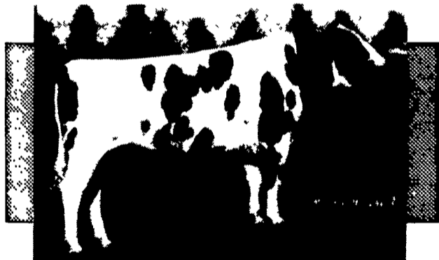
8H1751 Ever-Ready +2,106 lbs.M +$243 +127 CFP 4% calving dif.