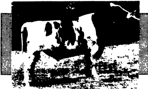
8H585 Outlook +2,057 lbs.M +$207 +103 CFP +.69 PTA-Type