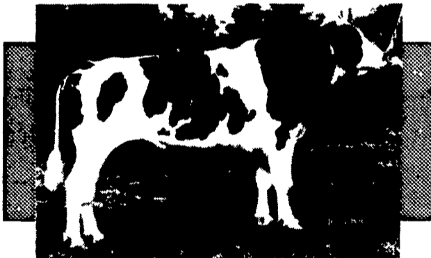
8H647 James +2,128 lbs.M +$207 +53P +1.12 PTA-Type