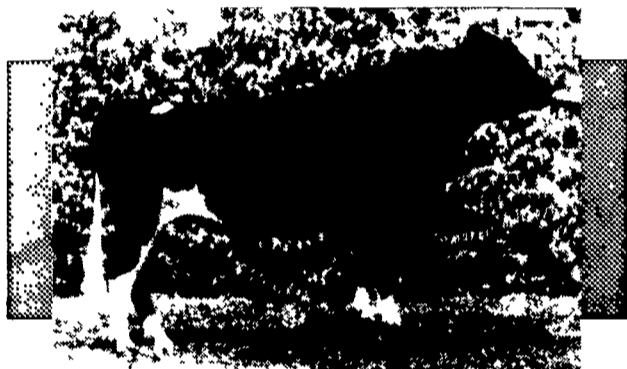
8H1626 Deputy +2,197 lbs.M +$264 +140 CFP 5% calving dif.

All S8 Sampling Program Graduates Over +2,000M