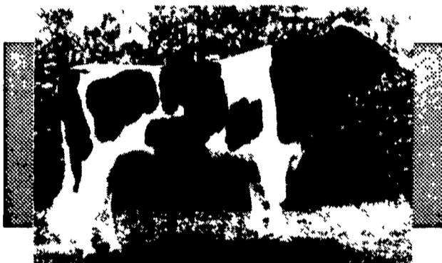
8H1651 Daylight +2,024 lbs.M +$253 +135 CFP 5% calving dif.