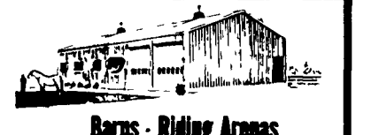
Barns - Riding Arenas With or Without Stalls

Building On Display At All Times In Columbus, NJ