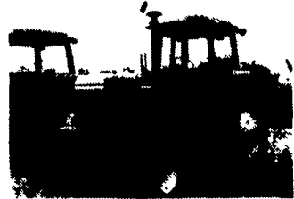
John Deere 1979, 4440 Cab, Air Quad, New 18.4x38 Radials, 3 Remotes Front & Rear Weights, 130 HP.