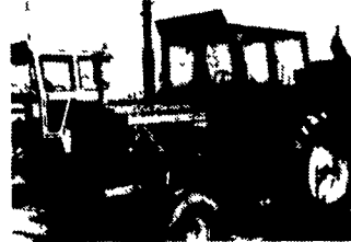
Allis Chalmers 1970, 220 Cab, 3 Pt., PTO, 2 Remotes, 18.4x38's, Front Weights, 135 HP.