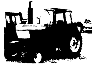
Ford 1984, TW15 Cab, Air, 18.4x38 Dyna Torques, Power Adjust Rims Front & Rear Weights, 121 HP.