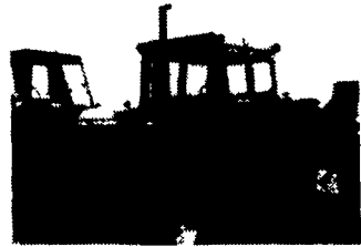
John Deere 1974 4430, Hinkler Cab Quad, 18.4x38 Dyna Torques Rear Wheel Weights, 125 HP.