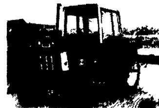
International 1976, 986, Cab, Air 18.4x34's 540/1000 PTO, Dual Remotes, Rear Wheel Weights, Good Condition, 105 HP.