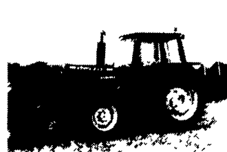
Ford 1984- 5610, 4WD, Cab, Air, 777F, QT Loader, 16.9x38's & 14.9x24's Rear Wheel Weights, 500 Hrs., 62 HP.