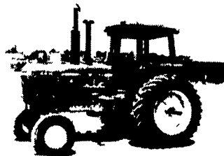
John Deere- 1982, 4440 Cab, Air, Powershift, 18.4x38 Dyna Torque Radials, Very Nice, 130 HP.