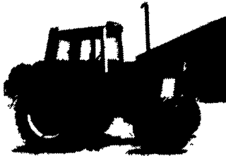
International 1977, 1486, 4WD, Cab, Air, 3648 Hrs., New 18.4x38", New 13.6x24", 540/1000 PTO, Dual Remotes, Good Condition, 145 HP.