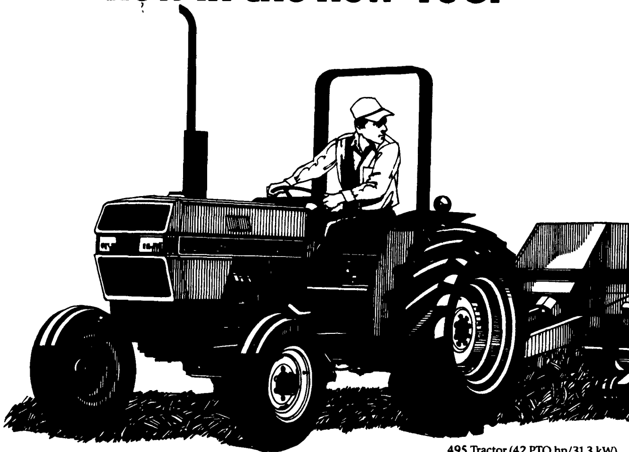
495 Tractor (42 PTO hp/31.3 kW)

And you get a lot more, too. Including new transmission options (like a synchronized shuttle shift and creeper speeds) and easier, faster shifting between gears. Exceptional visibility. And loaders improved for better visibility and serviceability. All to make the work go easier and faster.