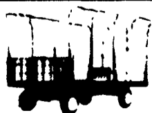
Steel Bale Throw Boxes