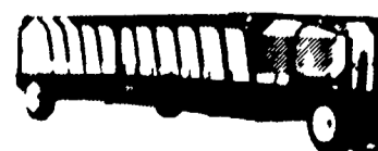
Cable Bunk feeders