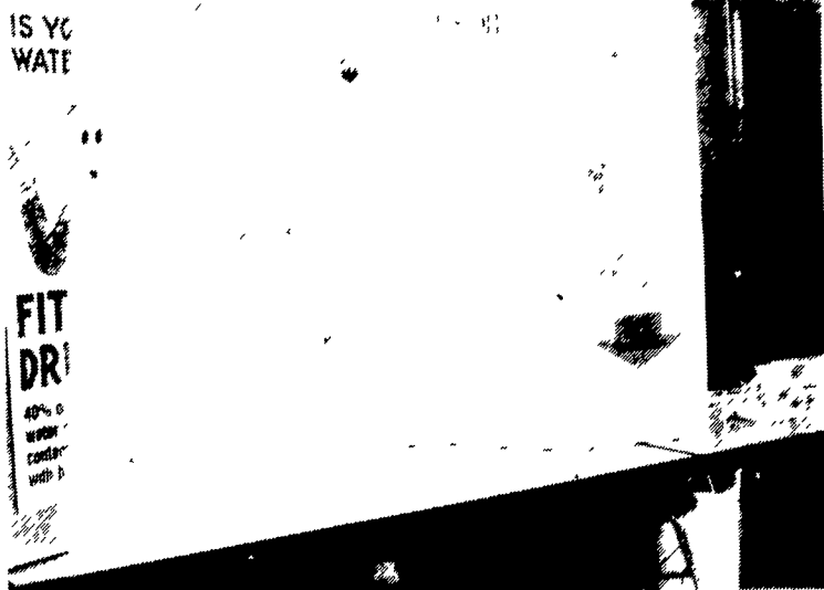
Exhibits provide an educational tool for participants.