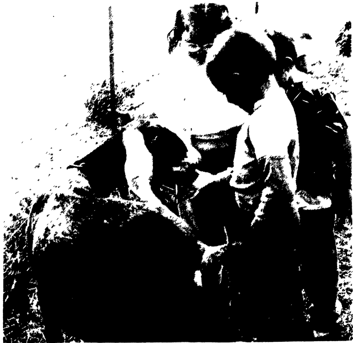
A petting zoo offers children an opportunity to experience farm animals.

With such a variety of events slated, pack up your family and join the Family Issues Task in Celebrating Your Family at Greenwood Elementary School and have a day of FUN!