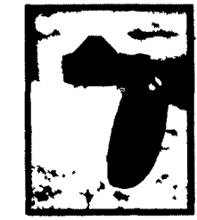
Pan Hangs On Cone For Easy Cleaning.