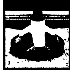
H2 Turkey Poult Feeder Has Feed Chutes To Fill Pans Without Any Spillage Onto Shavings.