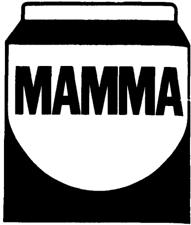
Middle Atlantic Milk Marketing Assoc