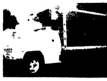
Ref. trucks of all sizes from 10 ft. to 22 ft. Thermo-King & plates 30 to choose from.

Used Truck Parts Gas and Diesel Motors Rears and Transmissions Tires Of All Sizes