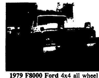
drive, PS 3208 Cat motor, w/or w/out snow plow and salt spreader, low mileage.