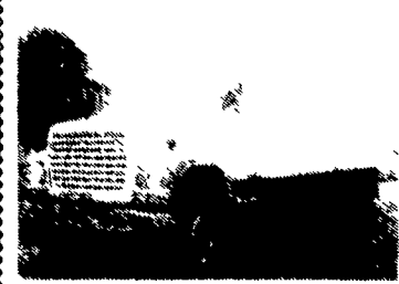
1979 LNT Ford 3208 cat motor, 10 spd. R.R. twin screw, w/or w/ out body.