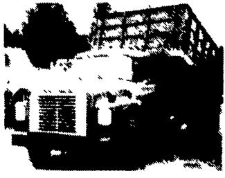
1972 Int. w/16 ft. grain body, 5 other grain body trucks to choose