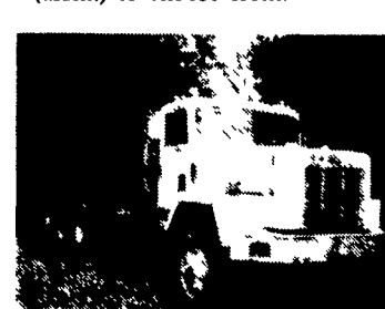
1977 Paystar 5000 Int. triaxle w/270 Cummins 9 spd. R.R., PS just reconditioned