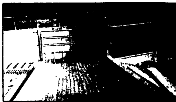
FEATURING TRACTOR GUARD FOR SCRAPING FEED LOT

- WORKING WITH FARMERS WITH CHESAPEAKE BAY FUNDING -