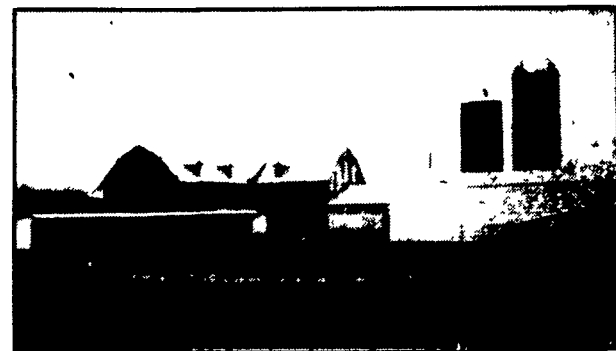
IN-GROUND MANURE STORAGE SYSTEM

Our Sales Tool Is A Satisfied Customer - Call Us For Information!