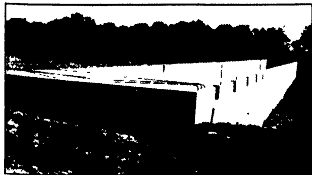
300' Long Manure Pit For Hog Confinement