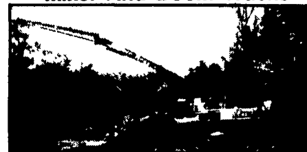
92' Boom Placing Concrete