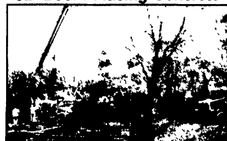
Placing Concrete On Site

Take the questions out of your new construction. Call Balmer Bros. for quality engineered walls.