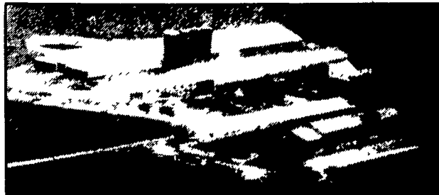
Far Left: 1-Million Gallon Circular Manure Storage Tank Far Right: 2 Silage Pits In-Barn Manure Receiving Pit

17 Years Experience In Pouring Concrete Manure Pits!