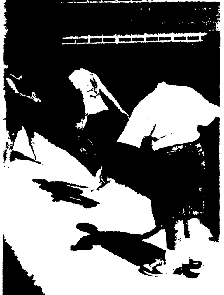
"Fit Kids" class taught the participants the importance of taking care of the human computer.