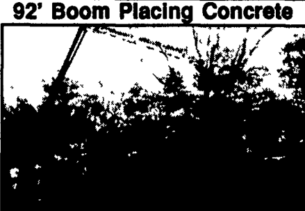
Placing Concrete On Site

Take the questions out of your new construction. Call Balmer Bros. for quality engineered walls.