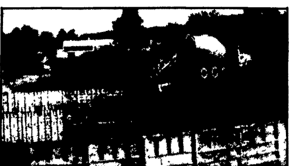
Construction Of Partially In-Ground Liquid Manure Tank - 400,000 Gallons