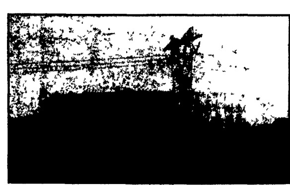
Above Ground Liquid Manure Tank 425,000 Gallons