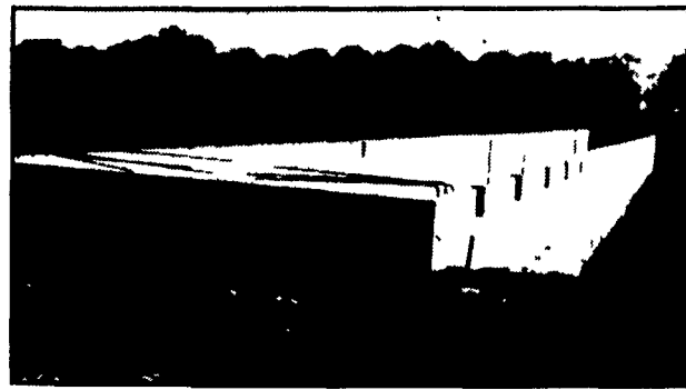
300' Long Manure Pit For Hog Confinement