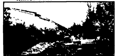
92' Boom Placing Concrete