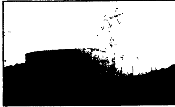
Above Ground Liquid Manure Tank 425,000 Gallons