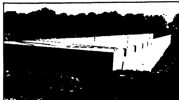
300' Long Manure Pit For Hog Confinement