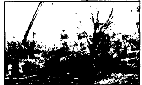
Placing Concrete On Site

Take the questions out of your new construction Call Balmer Bros. for quality engineered walls.