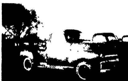
1954 Chevy Pickup's, 3 Speed, 6 Cylinder-Run Good, Easy Restoration Projects, 1 Is A 5 Window.