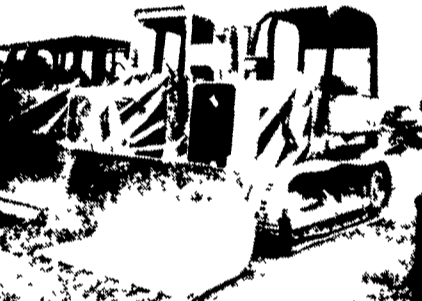
1977 John Deere 555 Crawler Loader, ROPS, GP w/Teeth, ROPS, New Paint, Runs Good.