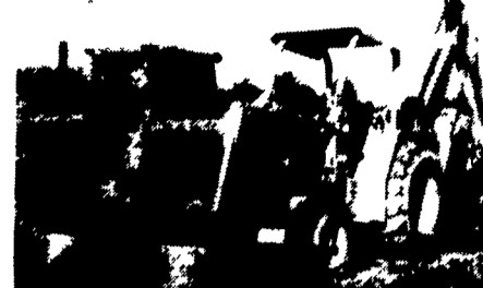
JD 510 Tractor Loader Backhoe, Diesel, Powershift, Runs Out Good, Good Paint.