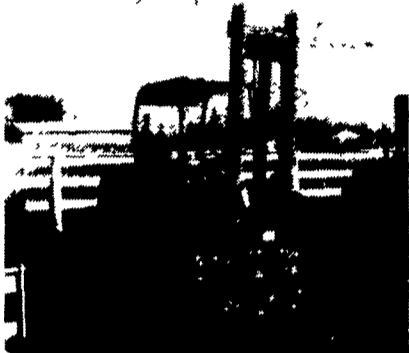
1973 Allis Chalmers 1600 Forklift, 21' Mast, Side Shift, New Paint, Rebuilt Engine.