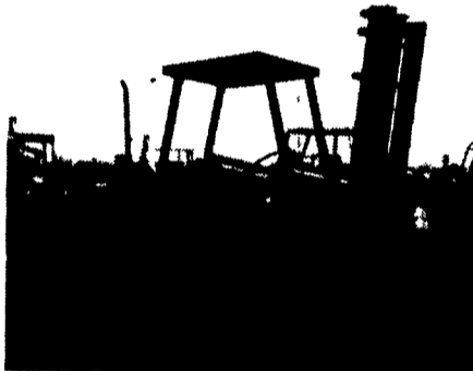
1982 Case 586C Forklift, 14' Mast, Free Lift, 1400 Hours, Side Shift, Original Paint, Very Good Condition.