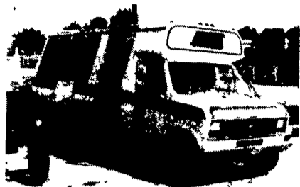
1985 Ford Passenger Bus, Dual Air, Dual Tanks, V8, PS, PB, Auto, Good Condition, Chrome Wheels, 16 Passenger, Horseshoe Seating Dual Heat, Dual Wheels.

HOURS: MON-FRI 7:30 To 5:00 SAT 7:30 To NOON